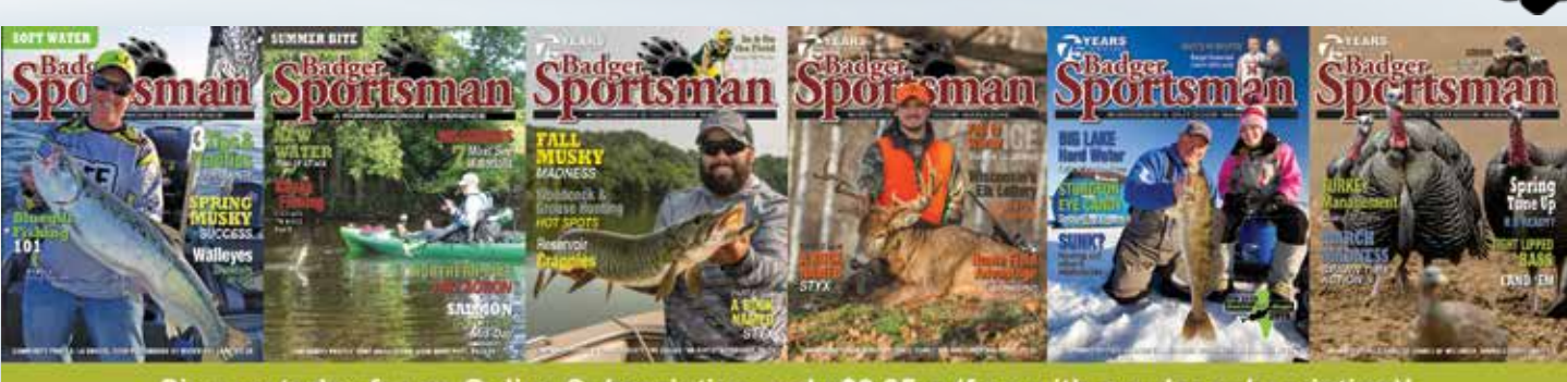
Sign up today for an Online Subscription, only $9.95yr (free with regular subscription)! http://BadgerSportsman.uberflip.com/t/48924?popup=subscribe

It became clear to me that Karch was practicing what he preached. Working diligently, teaching thoughtfully, and treating all of his attending kids as if they were the big fish.